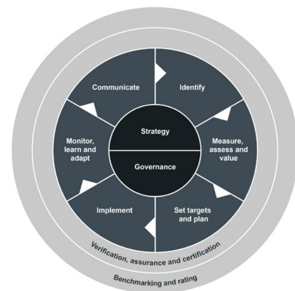
The Actions of Impact Management

The Partners welcome feedback on this current iteration of the map and the “system” in general. Click here to share your views.